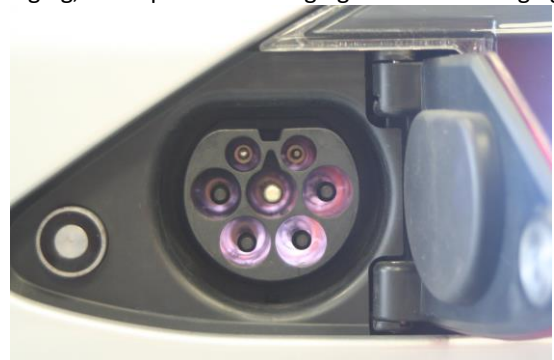
Pic: Tesla modified Type 2 socket (note notch at top to prevent use of Tesla Superchargers with normal Type 2 sockets).

The Model S is fitted with a modified Type 2 socket that does (depending on EVSE to vehicle communications) single phase AC charging, three phase AC charging or DC fast-charging.