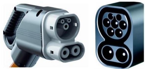
CCS2 charging plug and socket

Depending on the version, it can charge on single phase 7kW AC, 3 phase 11kW AC and DC quick charge EVSEs.