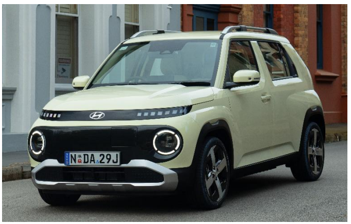
Hyundai Inster.