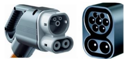
CCS2 charging plug and socket

The BYD Seal is fitted with a CCS2 socket allowing it to charge via Type 2 AC chargers 2 as well as CCS2 DC fast-chargers.