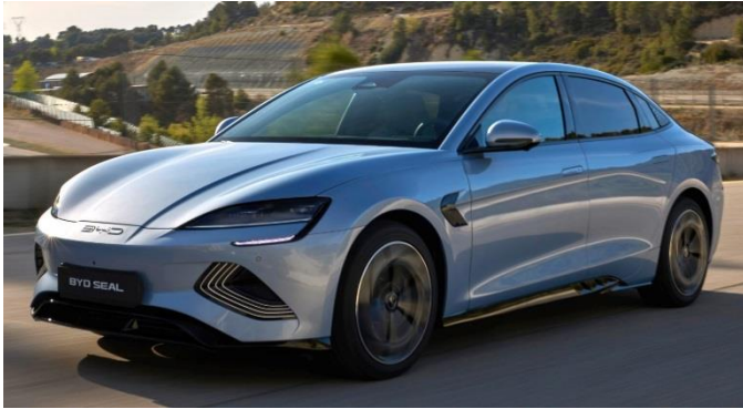
2023 BYD Seal.

Created and written by: Bryce Gatton Contact: Bryce@EVChoice.com.au