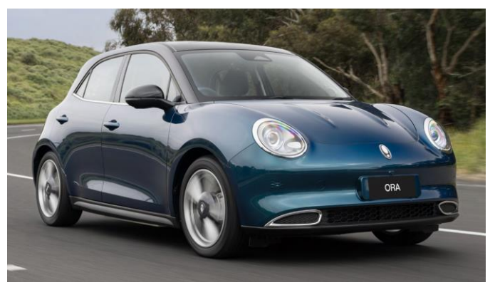
2023 GWM Ora.