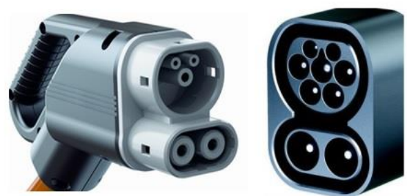
CCS2 charging plug and socket

Depending on the version, it can charge on single phase 7kW AC, 3 phase 11kW AC and DC quick charge EVSEs.