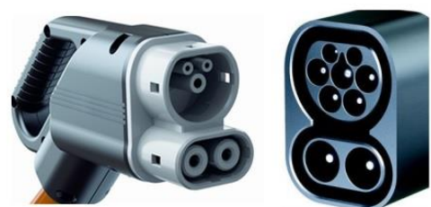
CCS2 charging plug and socket

The Kona Electric is fitted with a CCS2 socket allowing it to charge via AC as well as via CCS2 DC fast-chargers.