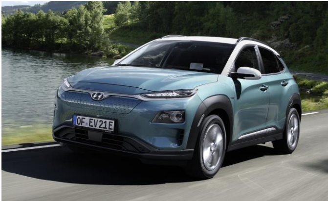
Kona electric.